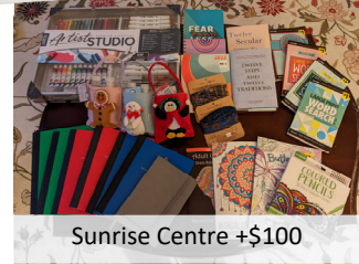
Sunrise Centre +$100