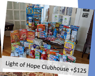
Light of Hope Clubhouse +$125