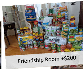
Friendship Room +$200